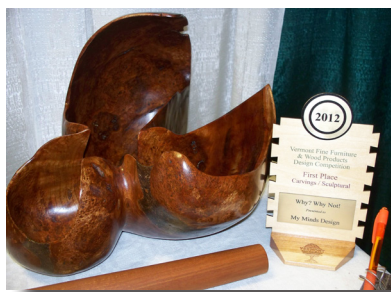
2012 First Place Carvings & Sculptural Entry Why? Why Not? by Jason Ballard

We will be holding the Vermont Furniture & Wood Products Design Competition at the Festival. Details on the competition will be available in the coming months, but it's not too soon to begin designing your entry. View details of past competitions by visiting www.vermontwooddesigns.org .