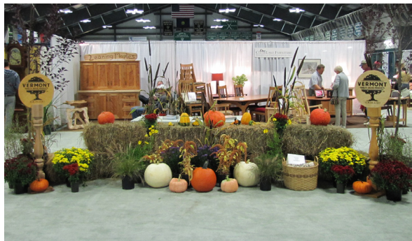
A well "dressed" Arena with complimentary Fall decor.

For those who haven't exhibited here are just a few things we do for you as an exhibitor. This event is marketed in publications like Boston Herald , Vermont Magazine , Vermont Life , Yankee Magazine , I-89 Travel Guide , Upper Valley Life , Vermont Standard's Destination Vermont Guide , Northern Woodlands , and more! We direct mail our full color event brochure naming you as an exhibitor to over 6,000 people, which include architects, second homeowners and high income residents of Vermont. We bring in new aspects every year so that our return attendees will make this their fall foliage destination for another year!